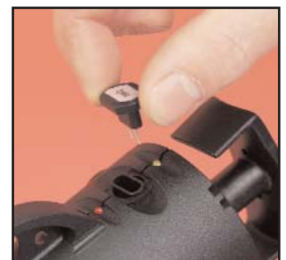
Optional plug-in temperature modules.