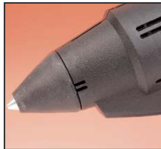
Safety nozzle shroud and increased ventilation.