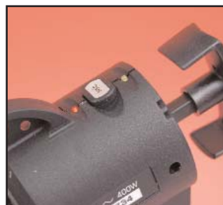
Indicator lights for 'power-on' and 'stand-by'.