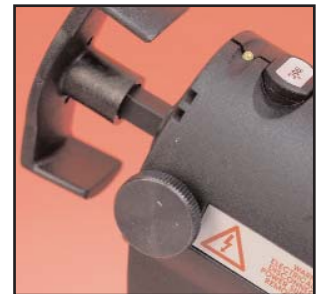
External thumb wheel for easy adjustment of the plunger release