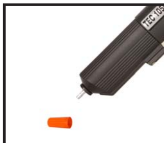
Ball check valve incorporated in each glue cartridge plus nozzle cap eliminates waste