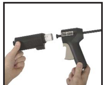
Quick and easy glue cartridge re-load