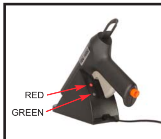
Base heating station with red 'on' light and green 'ready' indicator